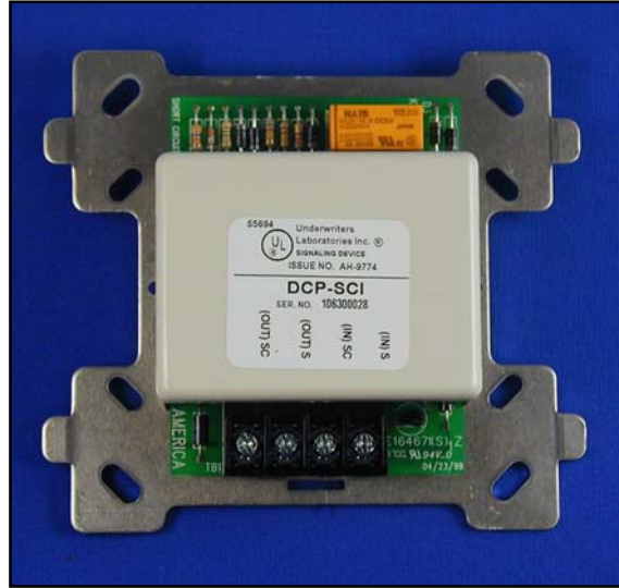
Back side of a DCP-SCI

The contractor shall furnish and install where indicated on the plans, the Hochiki DCP-SCI short circuit isolator. The modules shall be UL listed compatible with Hochiki Digital Communications Protocol (DCP) supporting control panel loops. The isolator module must be suitable for mounting in a standard 4" square electrical box or double gang. The isolator module must provide a yellow LED for indication of status.